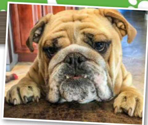
Seamus is always ready for a treat!